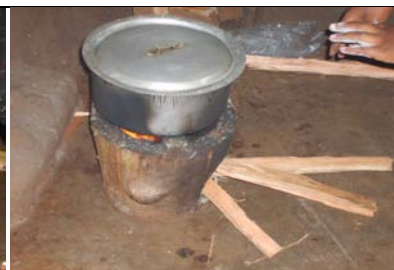
less than 2 sticks after boiling