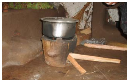
3 sticks before boiling

As soon as the food is boiling, take out one stick of firewood