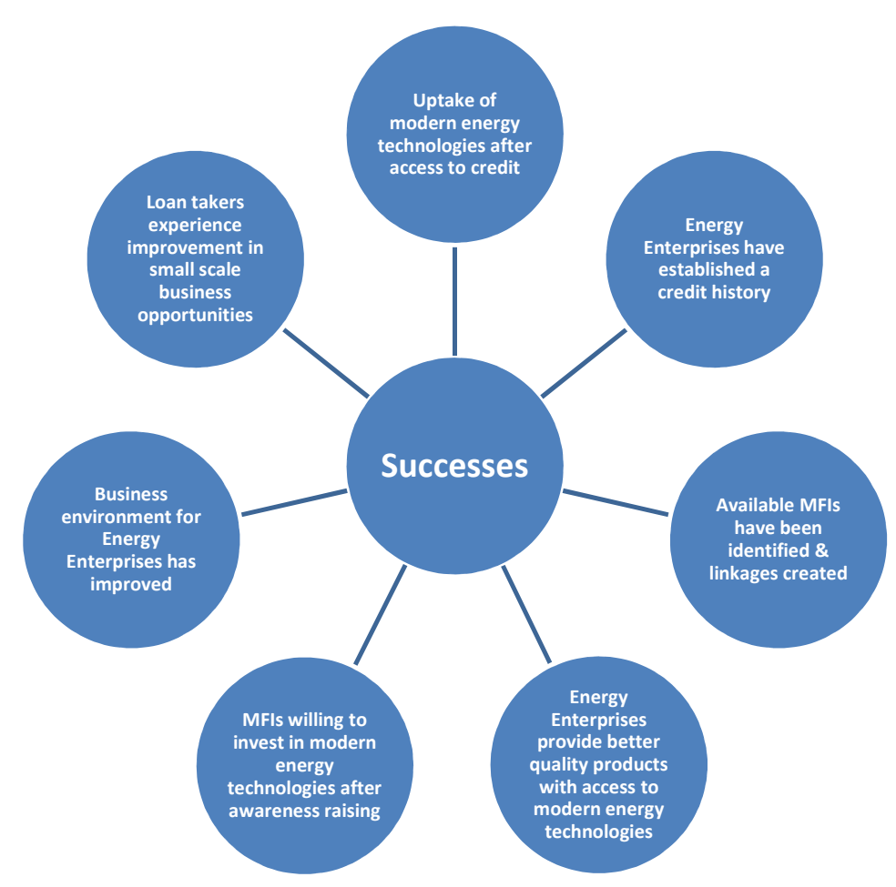
Figure 1 – Successes in provision of micro credit to energy projects

Turning to look at the challenges that the Energy Facility projects experience in relation to the provision of micro-credit to energy projects, we notice a number of common challenges: