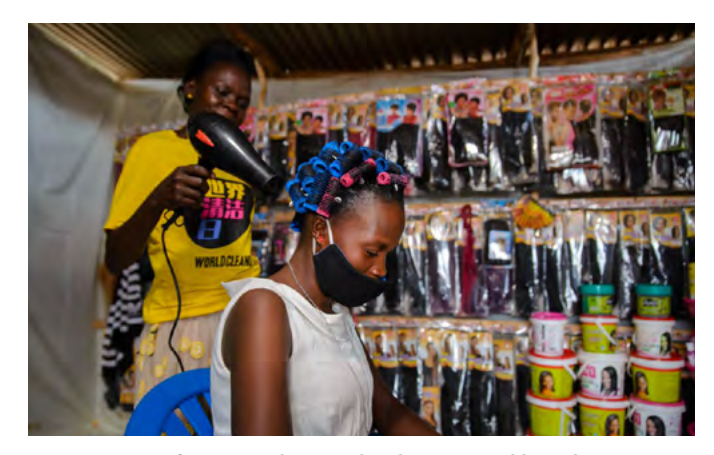
Picture 5: Beneficiary working with solar-powered hair dressing productive use appliance

The key finding is that demand in rural areas can be increased, if the mini grid construction is accompanied by an access to finance component. This could be a matching grant combined with training and coaching, which in turn decreases the debt risks of micro financiers.