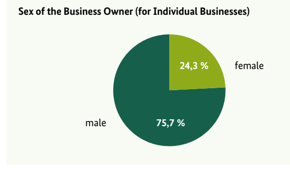
Figure 2: Sex of Business Owners