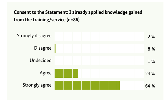
Figure 2: Application of gained knowledge

88% of the farmers surveyed report that they have already applied the knowledge gained from the training, mainly by irrigating their crops and starting to grow different types of vegetables (see figure 2). Others mention that they have brought light to their pig farms, have learned how to make liquid manure, or have started keeping records.