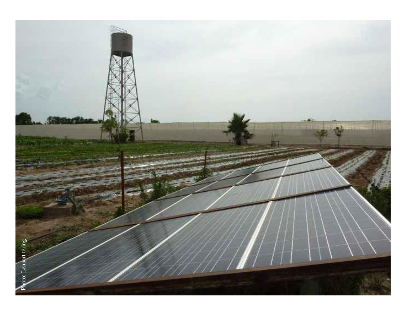
SPIS with an elevated reservoir used for irrigation in- and outside of the greenhouse