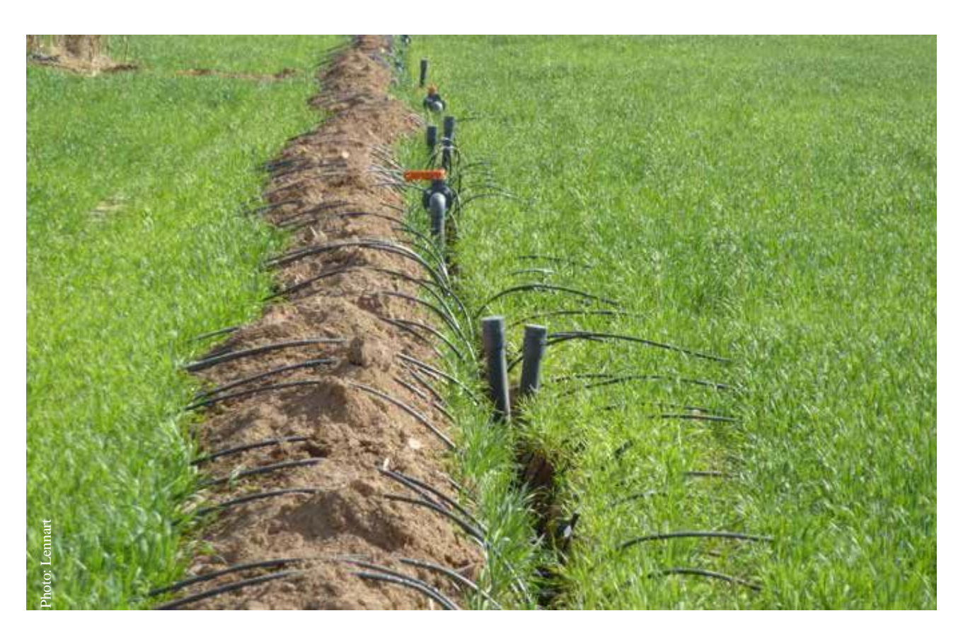
Installation of a drip irrigation system