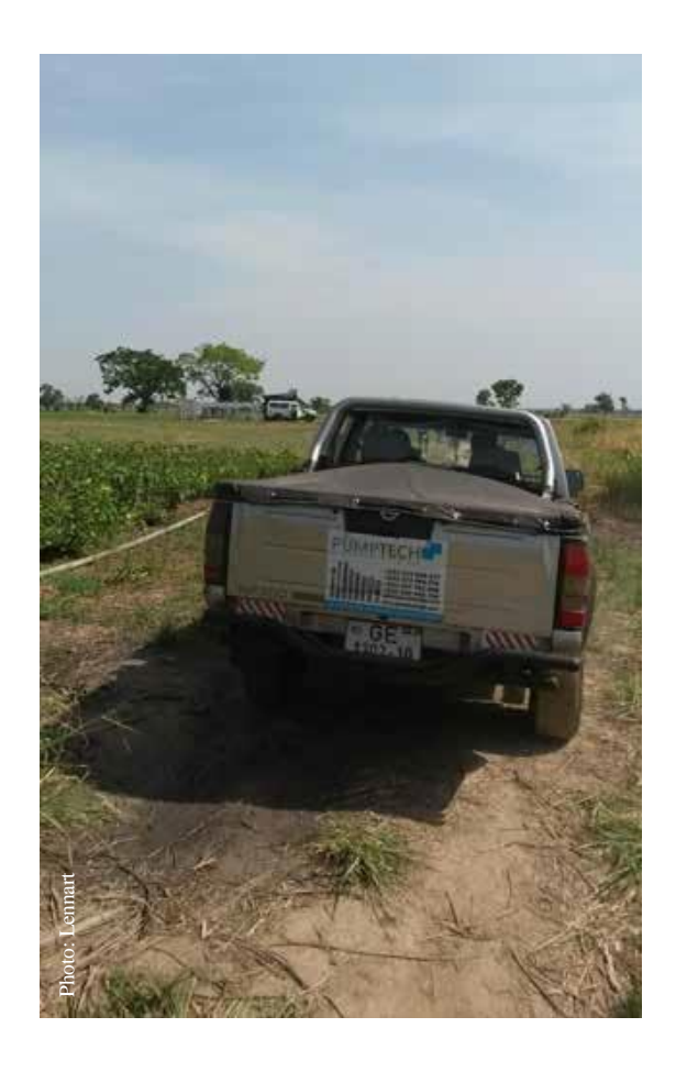
Installer visiting an SPIS site in Tamalé, Ghana