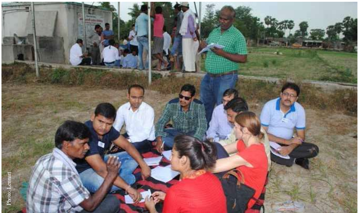
SPIS data collection field in India

The DESIGN – Site Data Collection Tool contains interview guidelines and check-lists to ensure that all required information for creating an SPIS design is available. The DESIGN – SPIS Suitability Check Tool is used to make a qualitative check if a site is suitable for an SPIS.