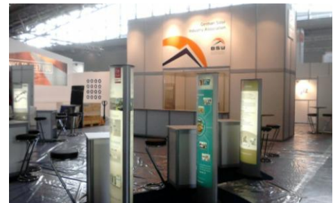
Impressions from the Off-Grid Power Forum 2014 Special exhibition and presentations program

At the special exhibition, exhibiting companies will display their products and technical solutions in the Off-Grid Power sector on board walls under the roof of the BSW-solar tradeshow booth. This year's exhibitors are Sunna Design, SOLAR23, Studer Innotec, develoPPP.de, Product Health and Energypedia