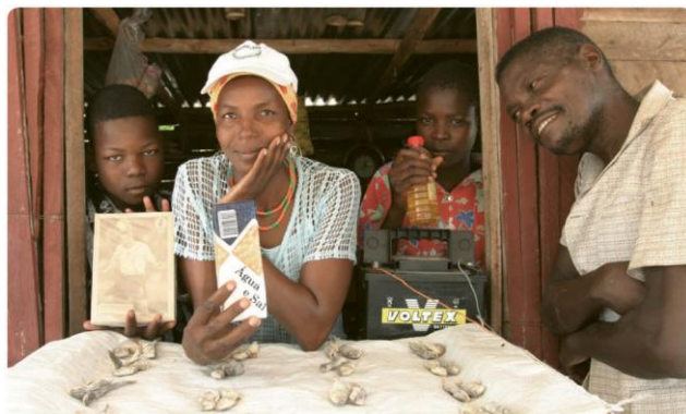
Small markets can extend their working hours in the evenings.