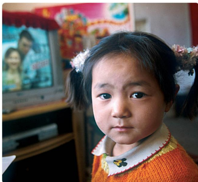
Studying in the evening and watching television is only possible with access to energy.