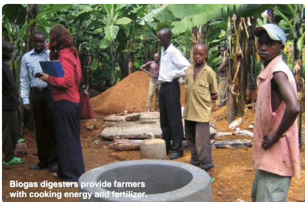
Biogas digesters provide farmers with cooking energy and fertilizer.

Activities clearly focus on those energy services and resources, which are reliable, affordable, socially acceptable and environmentally sound. EnDev initiatives should supplement ongoing activities. Hence, the core criteria for activities to be supported under EnDev relate to both quantitative output and longterm sustainability.