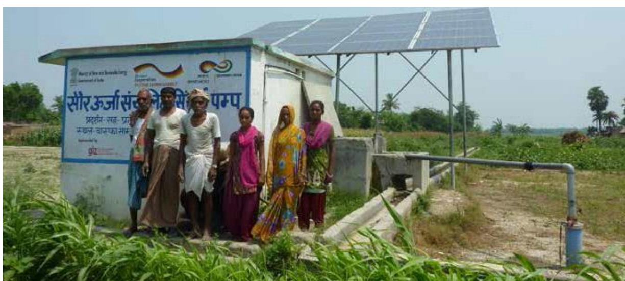
SPIS in India