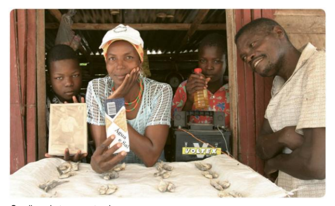
Small markets can extend their working hours in the evenings