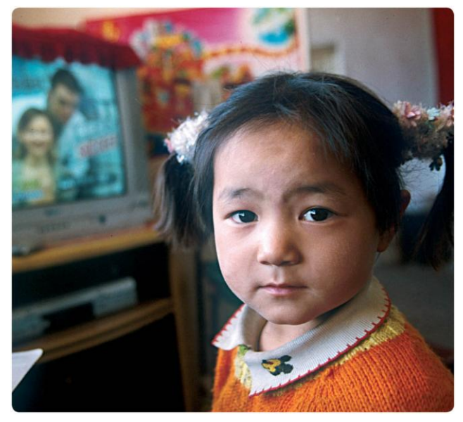
Studying in the evening and watching television is only possible with access to energy.