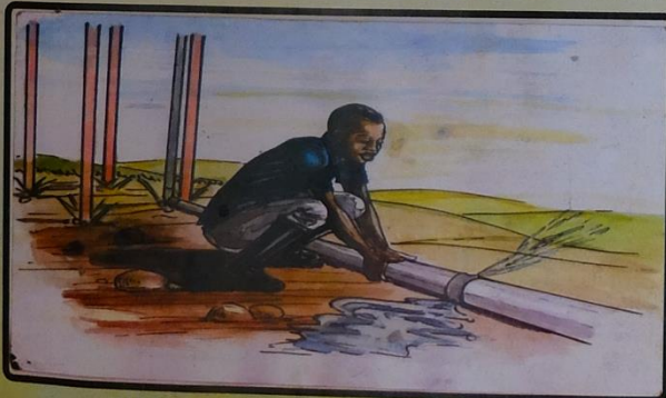
INSPECT WATER PIPING SYSTEM REPORT LEAKAGES TO A PLUMBER TO TIGHTEN ALL LOOSE SECTIONS