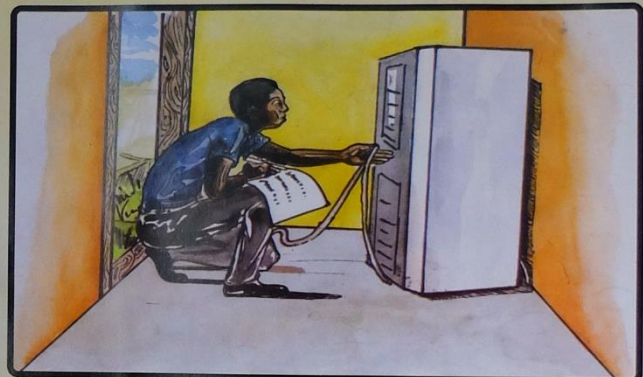
CHECK AND RECORD FAULTS CHECK FAULTS FROM INVERTER & REPORT TO THE TECHNICIAN