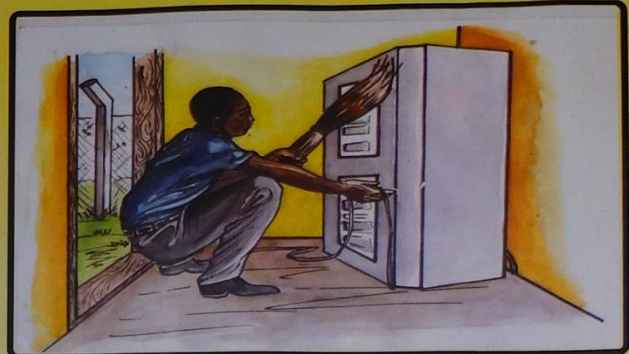
REGULAR CLEANING OF INVERTER CLEAN DUST USING A DRY CLOTH AND BROOM