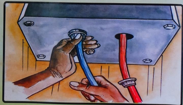
CHECK AND COVER UP ALL HOLES TO AVOID RODENTS AND LIZARDS FROM ENTERING THE INVERTER