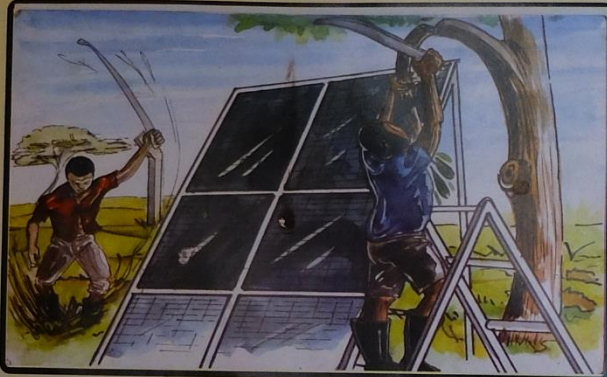
GENERAL COMPOUND MAINTENANCE CUT OVERGROWN TREES, SLASH THE GRASS TO GIVE ENOUGH LIGHT