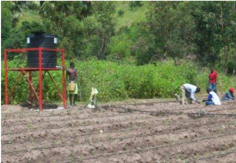
Solar-powered drip irrigation